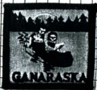
CAN/ONT. G.8. (c)