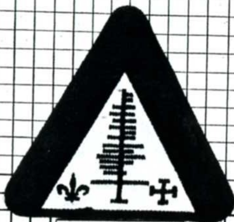
CAN/ASC. E.4. (b)