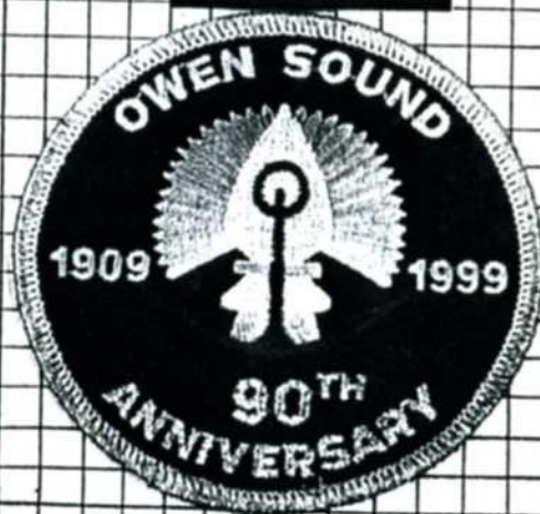
CAN/ONT. O.6/1. (a)