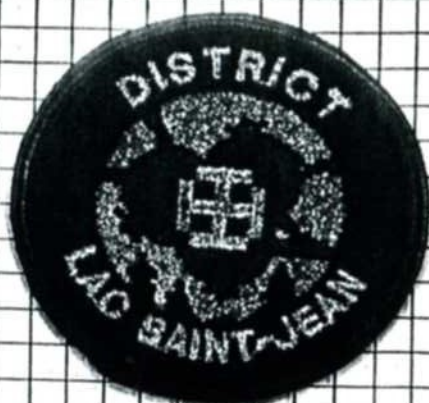
CAN/ASC. L.5. (a)