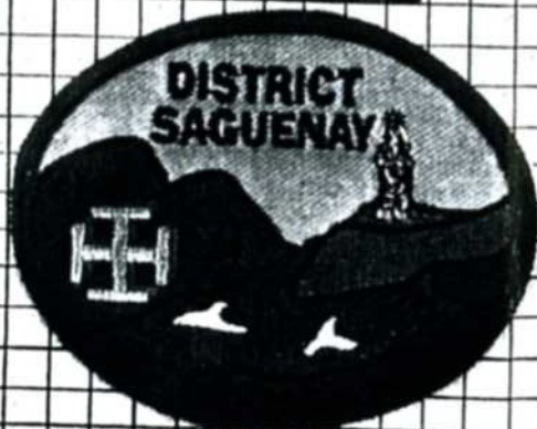
CAN/ASC. S.16. (a)