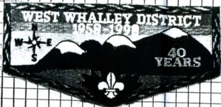
CAN/BC. W.3/I. (a)