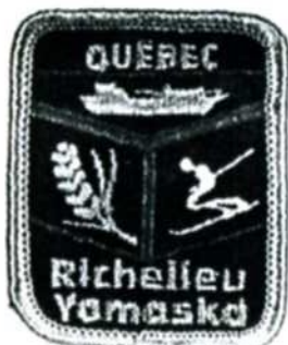
CAN/AEBP. R.1. (a)