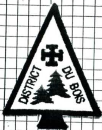
CAN/ASC. B.2. (c)