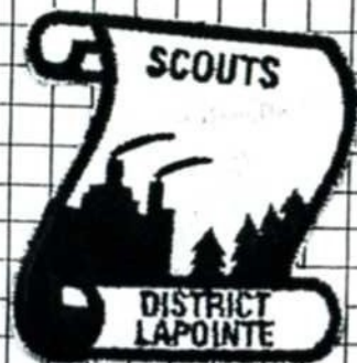
CAN/ASC. L.2. (c)