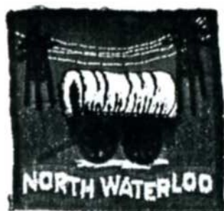
CAN/ONT. N.3. (c)

The badge committee has come across some badge variations that were overlooked when they first came out. These badges will be added to the Varieties Catalogue in their proper place. So please check your update #4 very carefully for these changes will affect any listings that you may have.