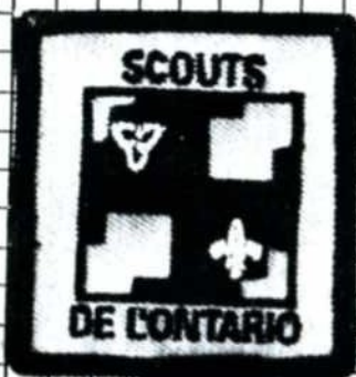
CAN/ASC. O.6. (e)