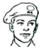
ROVER AIR SCOUT Air Scout cloth badge (gold) with metal "RS" bar below on dark blue beret

Senior Air Scouts wear the same uniform, but with the following differences. A metal "S" bar is worn under the gold Air Scout beret badge (fig. 1). A shoulder patch to denote the Patrol in place of the shoulder knot. Maroon epaulettes and Maroon garter tabs.