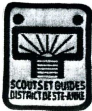
CAN/ASC. S.1. (c)