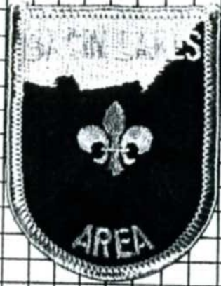
CAN/NS. B.1. (b)