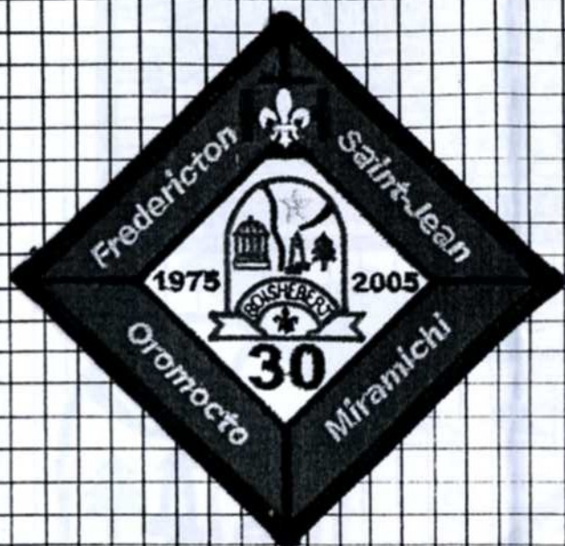
CAN/ASC. B.3/3. (a)