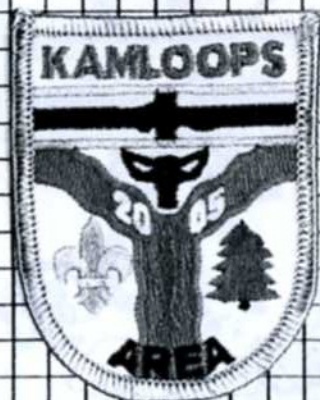
CAN/BC. K.3 (d)