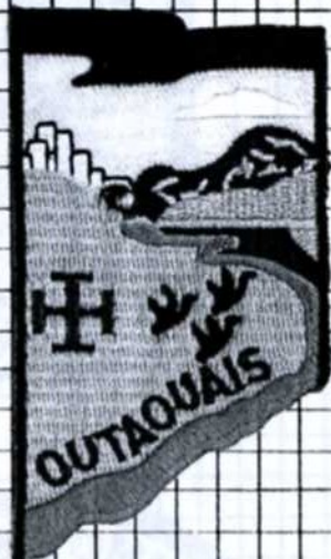
CAN/ASC. O.5. (b)