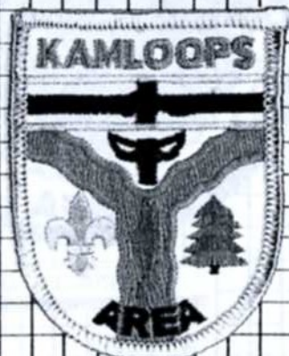
CAN/BC. K.3. (e)