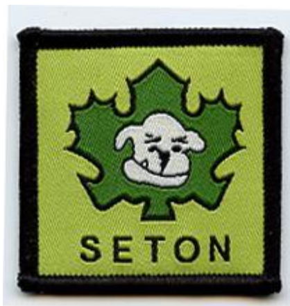
CAN/ONT S.29 (c)