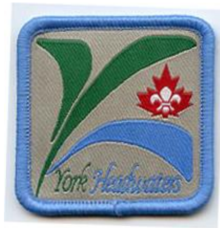
CAN/ONT Y8 (b)