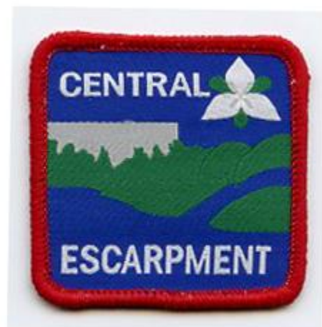
CAN/ONT C.15 (d)