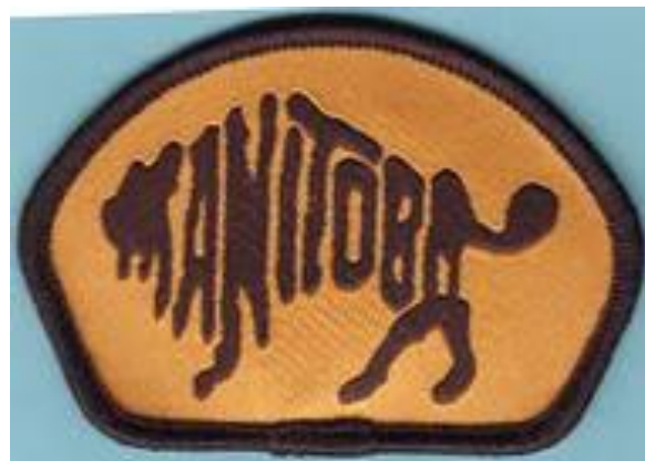
CAN/MAN 1 (I)