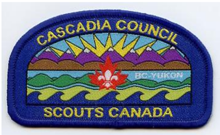
CAN/BC C.22 (c)