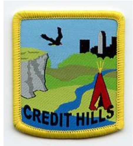
CAN/ONT C.17 (a)