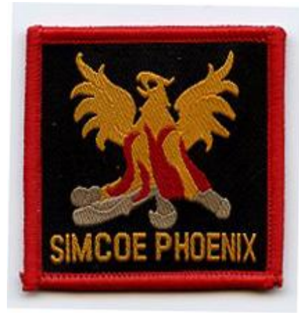
CAN/ONT S.34 (b)