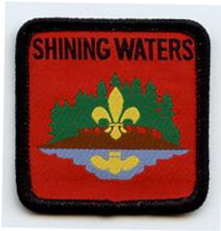
CAN/ONT S.33 (c)