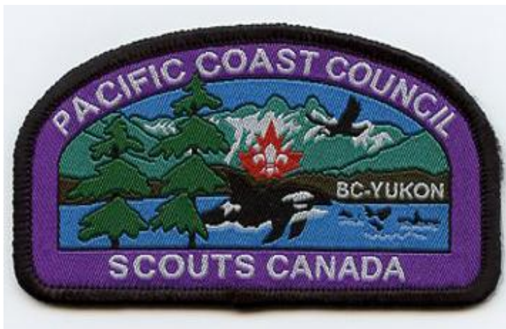
CAN/BC P.6 (c)