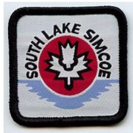
CAN/ONT S.8 (e)