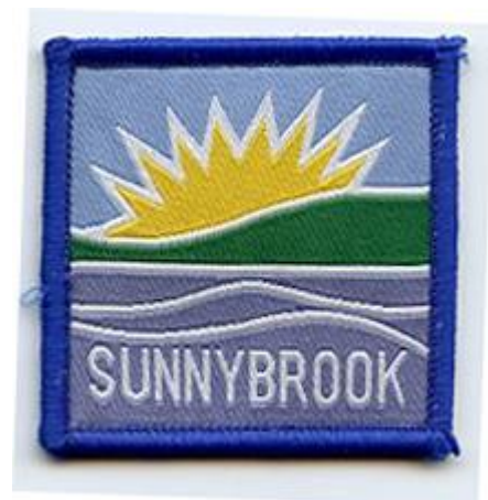
CAN/ONT S31 (c)