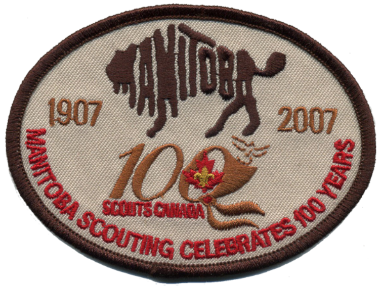
CAN/MAN 2007 1A