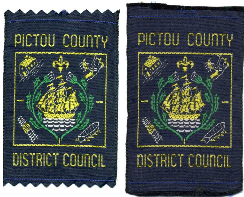
NS P1D (52x68 mm)