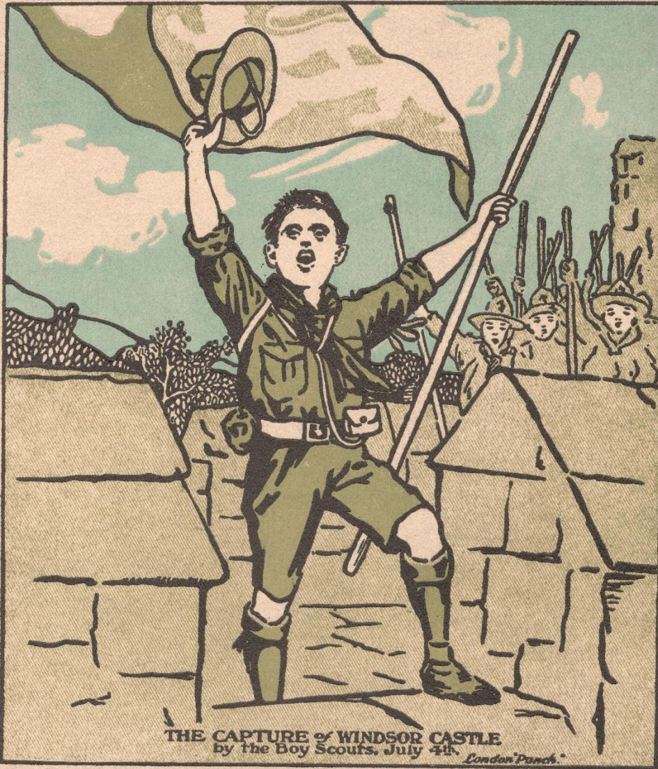
THE CAPTURE OF WINDSOR CASTLE by the Boy Scouts, July 4th. London Punch.

REPORT OF THE CONTINGENT AT CORONATION AND AT THE KING'S RALLY, WINDSOR PARK ENGLAND, JUNE-JULY, 1911.