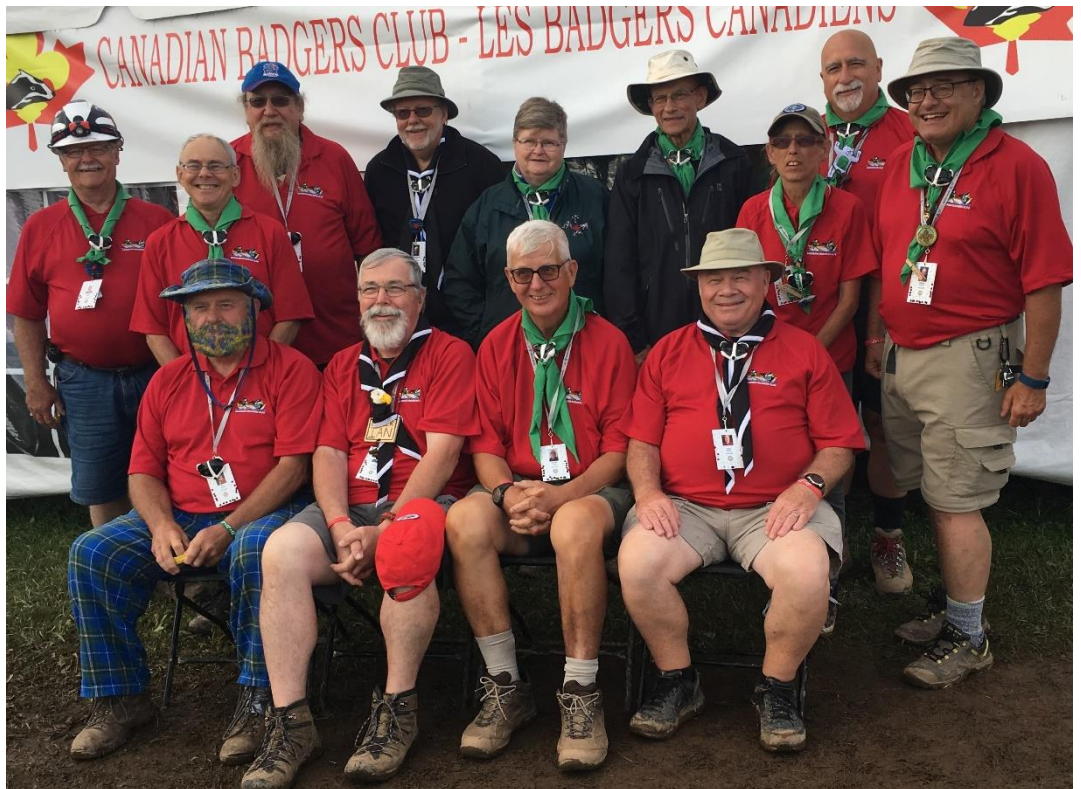
CJ 17 Team