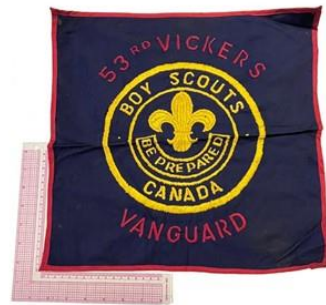
LOT # 24.