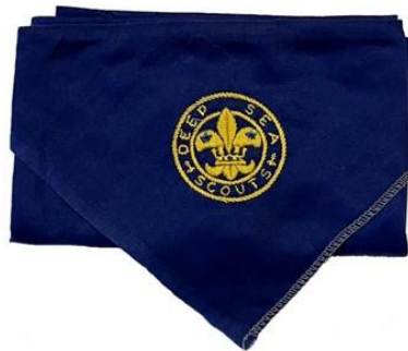
LOT # 39.