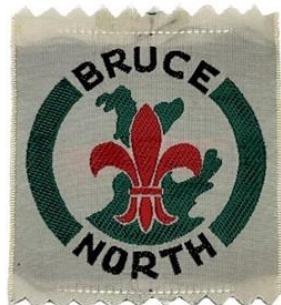
LOT # 62