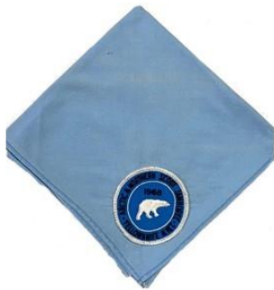
LOT # 5.