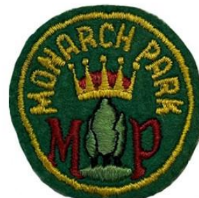
LOT # 74.