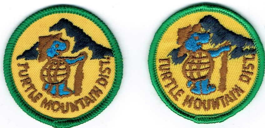
T.6.C is on the left and the new find T.6.D is on the right.

A new find Turtle Mountain District badge from Manitoba turned up. We are calling it MAN T.6.D It is different from the other round C version in the placement of the two lakes and the ragged nature of the lake. While this might look like shoddy work it is actually more similar to the lakes in the A and B versions of Turtle Mountain.