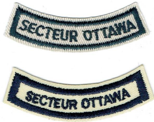
ASC O.10.A on the top and ASC O.10.B below.

There were a number of badges examined where a decision was made not to list but to instead alter the listing to indicate a size range for the badges. These were ASC: Iles De La Madeleine (I1D) different heights; Clare different heights; Rive-Sud-Beauce different lengths and Iles De La Madeleine (I1C) different widths. You will see these small changes in the next edition of the catalogue.