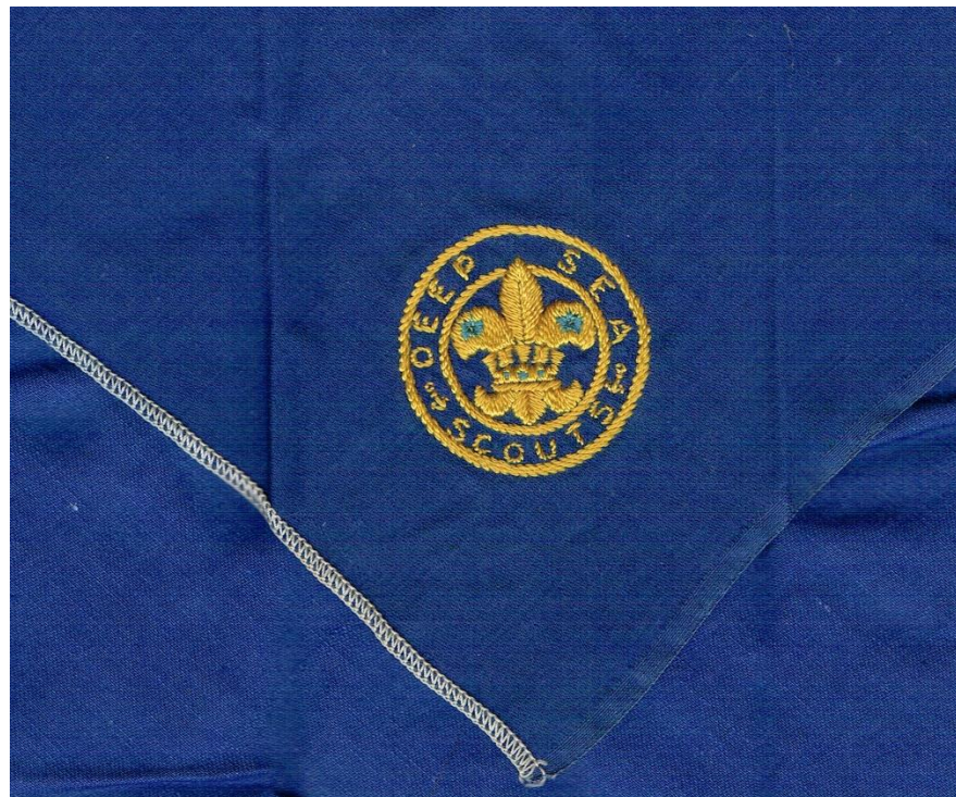
Note, picture reduced in size.