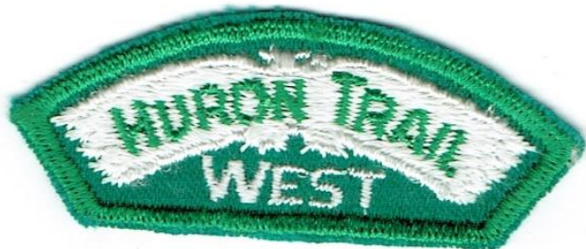
Ontario H.12.A top portion of the two piece badge.

Peeter Tammark had an interesting question, that I do not know the answer to and that relates to the A issues of the various Ontario Huron Trail badges (H10A, H11A and H12A). This is a two piece badge rather than the B issues which were one piece badges. Sometimes one comes across just the written, top part of the Huron Trail's A badges rather than the whole two piece badge. The question in Peeter's mind was whether the written part was worn alone on uniforms before a two piece badge was produced. Does anyone know?