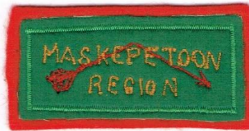
Trial badge for consideration of Region