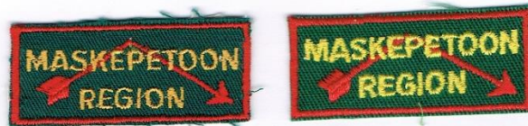
Badge worn on pocket flap by all members