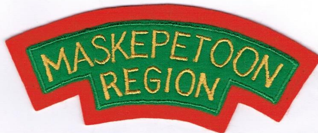
Shoulder flash worn by Regional Commissioner and ARC

I thank all who bring new badges or badge questions to my attention. Keep it up! Please contact me with your finds or answers to questions at: ennisgl@telus.net .